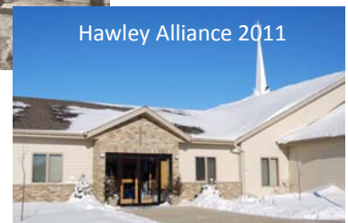
Hawley Alliance 2011