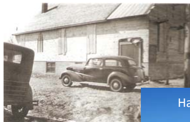
Hawley Alliance 1938